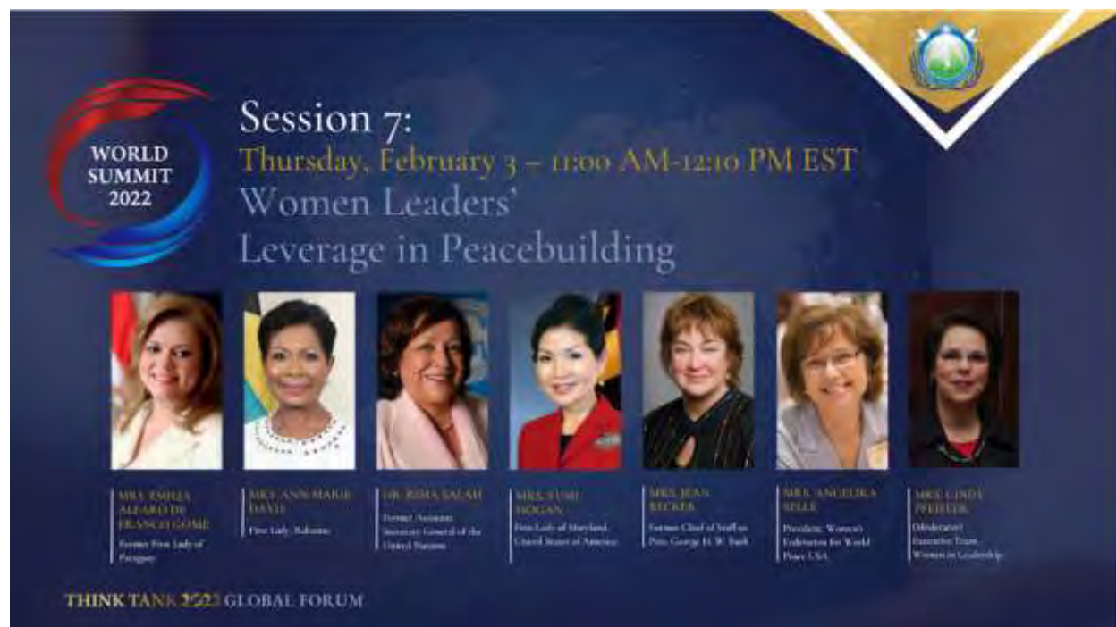
Promotional Flier for the event